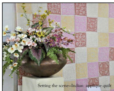
Setting the scene—Indian applique quilt