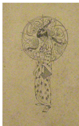
F498/2 S.R. Clint

To date three Clint images have been selected: