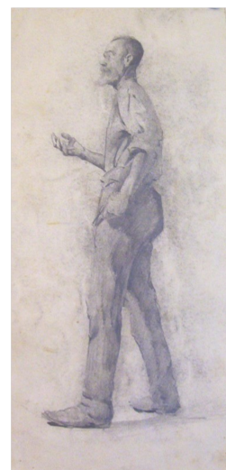
F202/2 A.T. Clint