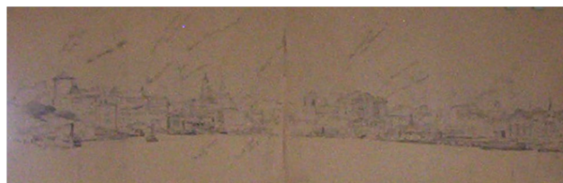
Panorama of Sydney from harbour with buildings identified

With this final 2022 Newsletter, we wish members an inspirational and creative holiday break.