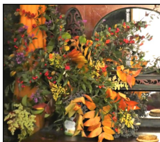
Autumnal tones in a floral arrangement provided warmth to the entrance porch.