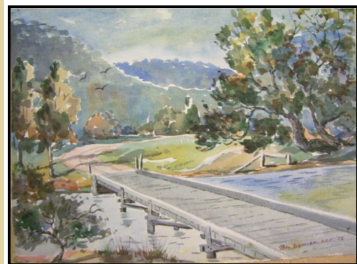
Bro Damian FSC. 26 x 34.5 cm. Water colour on medium weight paper. 1959. Upper Colo River Bridge

In attempting to include works from our Collections which have not been exhibited, the Curatorial team have found the escalating costs of matting a real challenge.