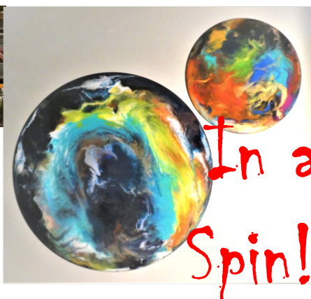
Vinyl 's transformed to an art form during Sunday's Resin Workshop!

Seven women challenged themselves to be creative when they signed up for last Sunday afternoons Workshop.